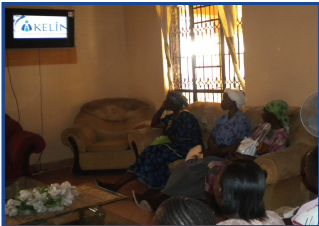
Participants watching the KELIN video on cultural structures project

This was followed by watching a documentary produced by KELIN.