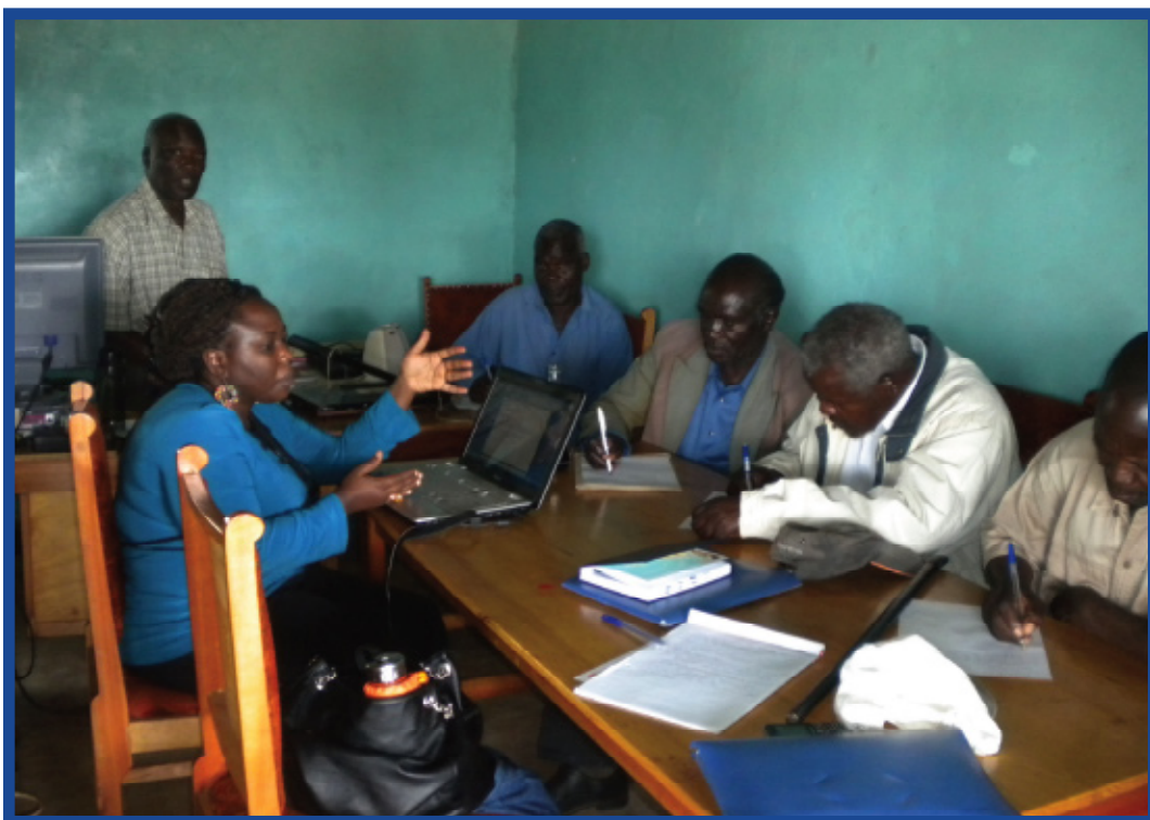
The Project Coordinator of the Cultural Structures Project explains the outcome of the meeting to elders