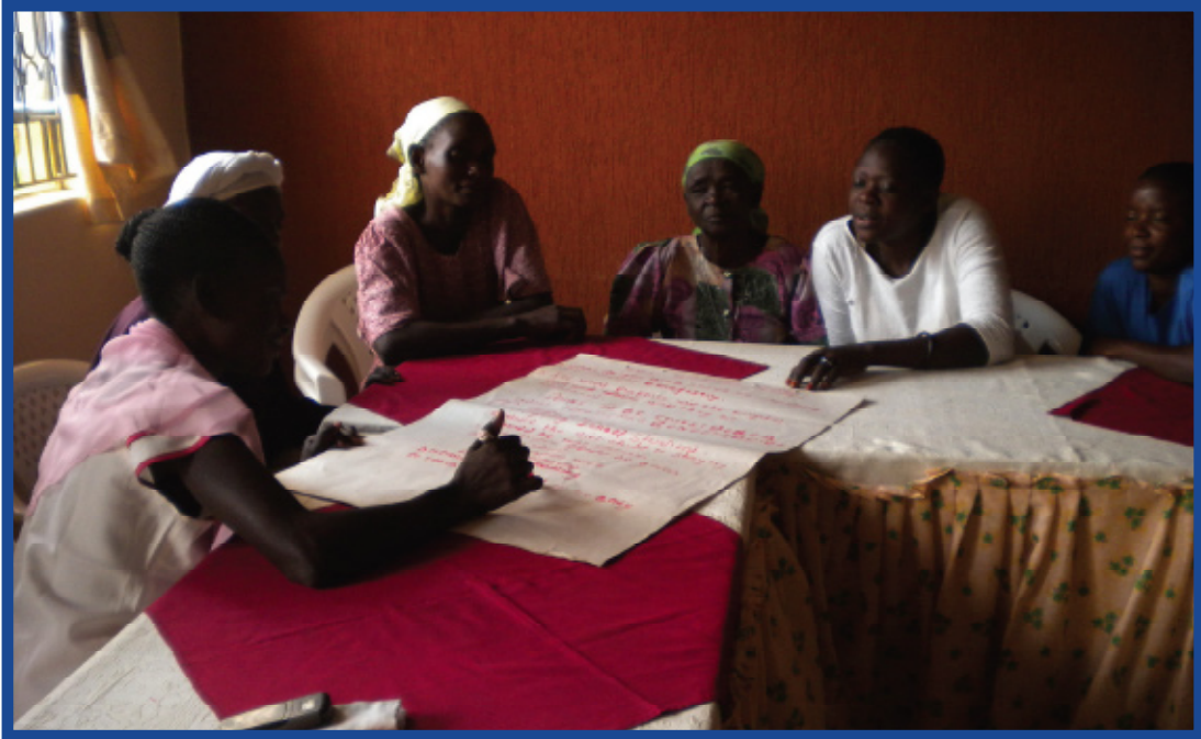
Participants during discussion and presentation