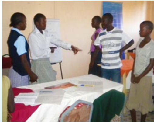
A group of children perform a skit depicting various human rights violations likely to be experienced by women and girls within their families. The message in the play warned about against non-education of the girls, dominance of the husband's decisions including demanding for compulsory testing for HIV.