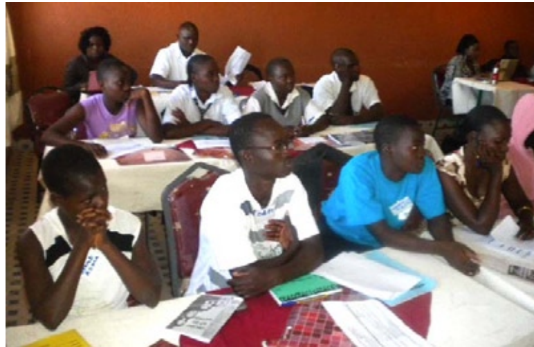
Participants keenly listening to the facilitators

This would reduce their vulnerability to HIV and encourage their involvement in addressing harmful local cultural norms and practices that affect them and others around them. This will ultimately contribute to the sustainability of this innovative project within the Nyanza region and its expansion to other regions of Kenya.