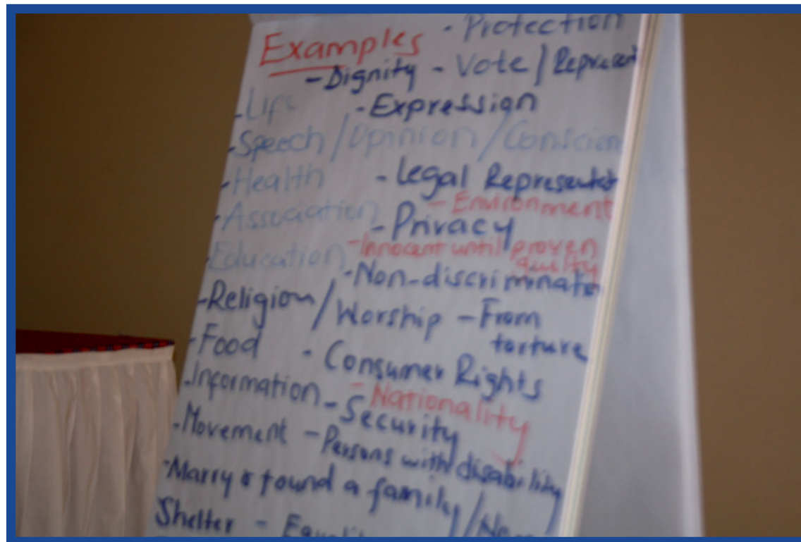
Participants' examples of Human Rights

It was designed to acquaint the participants with the general understanding of Human Rights, the principles relating to human rights and the international and national frameworks on human rights. At the end of the module the participants were expected to be able to articulate the specific rights relating to HIV and AIDS and understand the Linkage between HIV and AIDS, human rights and health. The session specifically discussed the following aspects of human rights: The meaning, characteristics, general principles, underlying principles, history, international and regional human rights regime, human rights abuses and violations, how international human rights norms are created and International Instruments Relevant to HIV e.g. ACHPR, CAT, CEDAW, CERD, CRC, CRDPWD, CRMW, GIPA, ICCPR, ICESCR, etc.